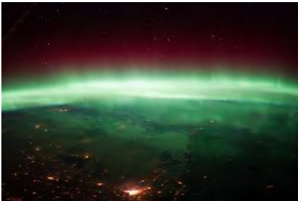
The aurora seen from the International Space Station.