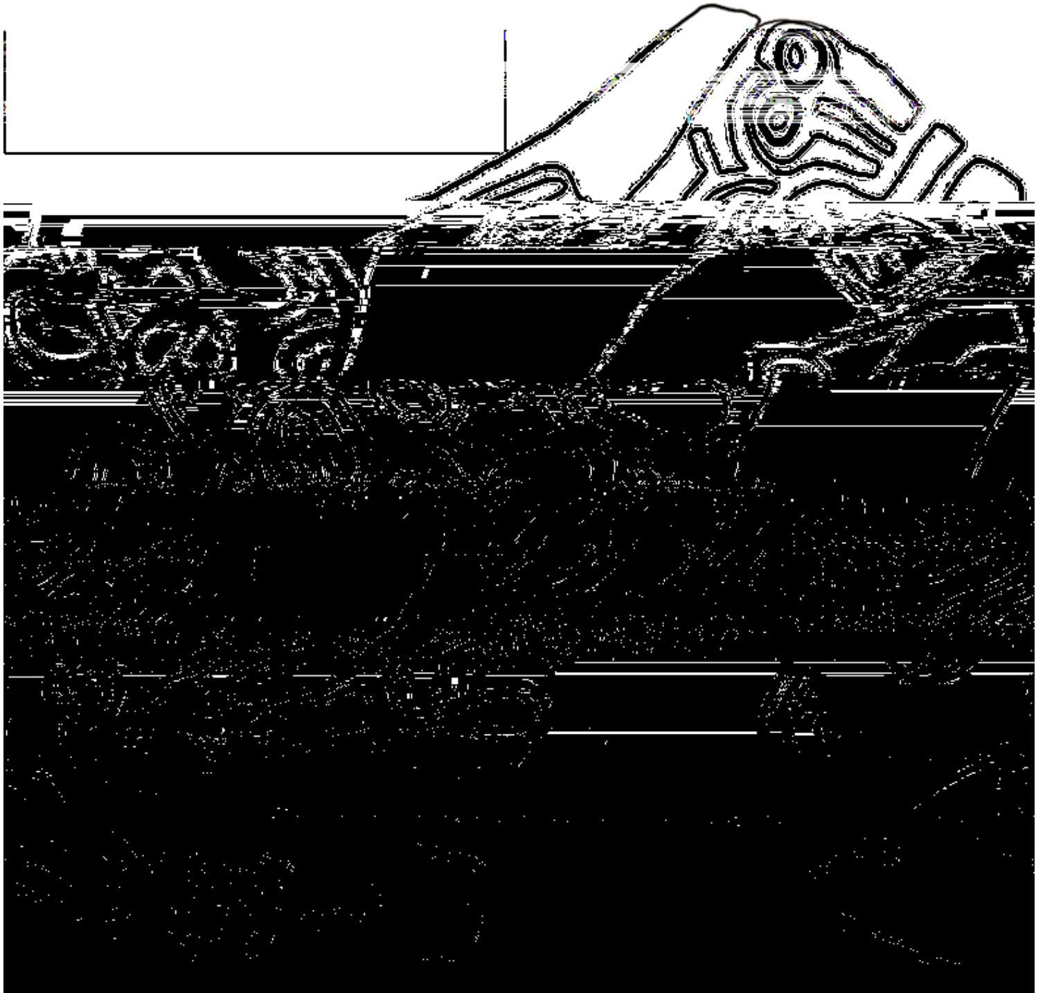
Drawing of the Seal Stone by Mareca Guthrie, Curator of Fine Arts at UAMN.