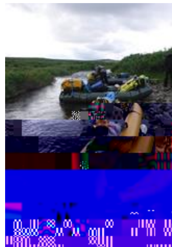
Canoe paddles are one type of lever. Archaeologists and other scientists use them while doing fieldwork.